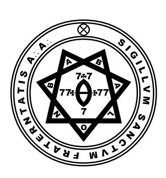
\begin{array}{c} A \ensuremath{:}\!: A \\ \text{Publication in Class C and D} \\ \text{Official for the Grade of Babe of the Abyss} \end{array}